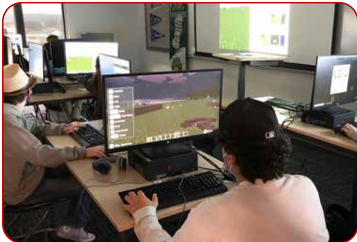
Stanwood High School students use technology purchased with levy funds to learn coding in this career and technical education class.